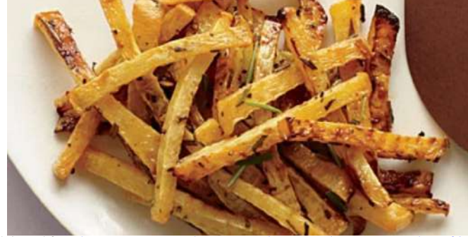
Adapted from https://www.myrecipes.com/recipe/roasted-rosemary-rutabaga-fries