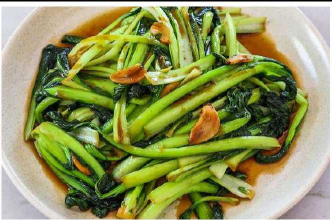
Adapted from https://seonkyounglongest.com/stir-fried-bok-choy/